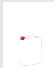
Can 5 l Art. no.: 2001485